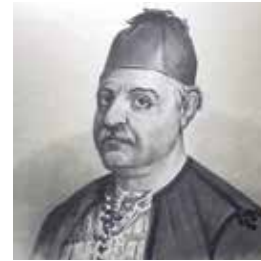
Andreas Vokos (Miaoulis) (1769-1835) Greek shipowner, politician, and naval commander.