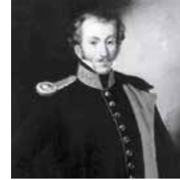
Dimitrios Ypsilantis (1793-1832) Greek nobleman, military leader, and politician.