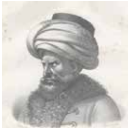
Omer Pasha Vryonis Commander-in-Chief of the Sultan's forces in Greece.