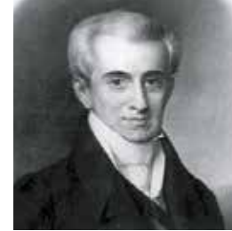
Ioannis Kapodistrias (1766-1831) Greek diplomat and politician, Count. Foreign Minister of the Russian Empire, first Governor of the newly established Greek state.