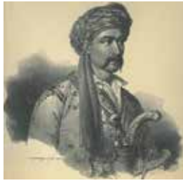
Nikitas Stamatelopoulos (Nikitaras) (c. 1784-1849) Greek military leader, also known as Tourkophagos (the Turk Eater).