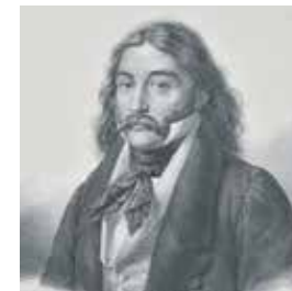
Alexandros Mavrokordatos (1791-1865)

Military leader of the Greek Revolution.