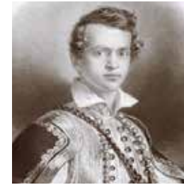
Otto Friedrich Ludwig von Wittelsbach (Otto I) (1815-1867) Bavarian prince and first King of Greece.