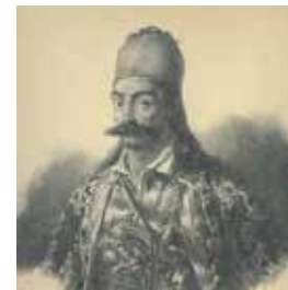
Georgios Karaiskakis (1782-1827)

Military leader of the Greek Revolution.