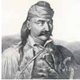
Theodoros Kolokotronis (The Old Man of the Morea) (1770-1843) Commander-in-chief of the Greek forces in the Peloponnese.