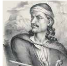
Odysseas Androutsos (c. 1788-1825) Greek general in the army of Ali Pasha and then commander of the Greek forces.