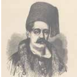
Ioannis Kolettis (1773-1847) Greek politician, founder of the "French Party," Prime Minister of Greece (1834-1835; 1844-1847). Implicated in the execution of Odysseas Androutsos.