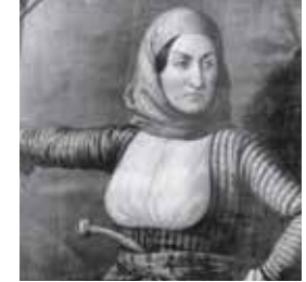
Laskarina Pinotsi (Bouboulina) (1771-1825) Ship owner, heroine of the Greek Revolution, naval commander.