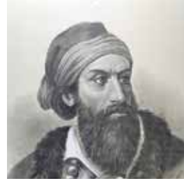
Grigorios Dikaios (Papaflessas) (1788-1825) Greek clergyman, politician, and military leader.