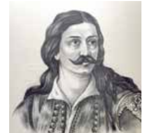
Athanasios Diakos (1788-1821) Greek military leader, among the first who died for the Greek cause.