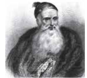
Ali Pasha (1740-1822)

Reformer, diplomat, and politician. Backed a plot to murder Odysseas Androutsos.