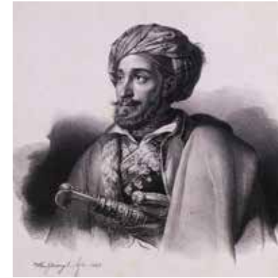
Ioannis Makriyannis (1797-1864)